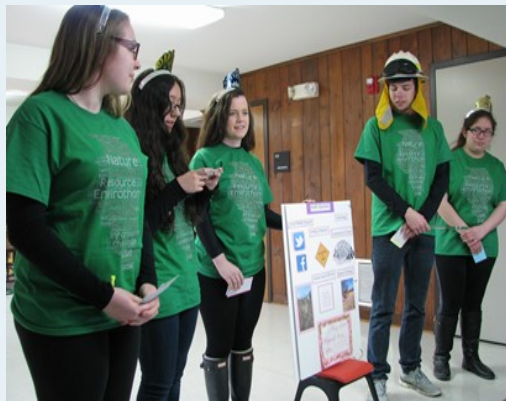
Belvidere High School Oral Presentation

The Envirothon experience provides students with the ability to think critically and enhance their problem solving skills. It gives students the ability to be role models in their community. Lastly, it prepares student for future careers in natural resource areas.