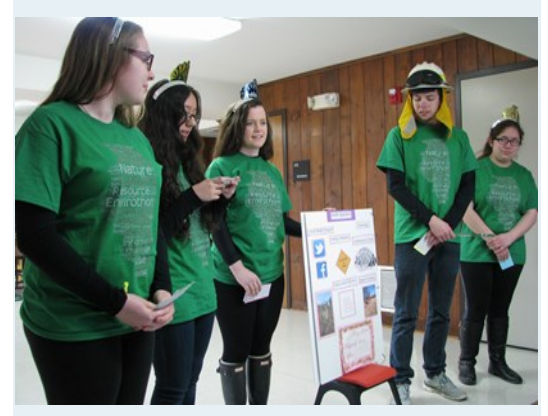
Belvidere High School Oral Presentation

The Envirothon experience provides students with the ability to think critically and enhance their problem solving skills. It gives students the opportunity to be role models in their community. Lastly, it prepares student for future careers in natural resource areas.