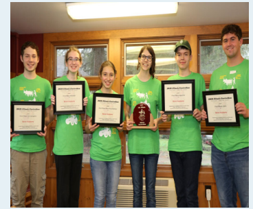
Benet Academy, Northeastern Illinois and Illinois Envirothon winning team. Sponsored by Land Use Council 16.

For over 25 years, the Northeastern Illinois Envirothon has continued to be a successful event and brings together diverse groups of students. We hope organizations, like yours, considers a contribution towards the Northeastern Illinois Envirothon competition. Your donation is tax deductible and will aid in continuation of environmental awareness. Become part of the environmental education movement in your community today!