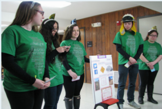
Belvidere High School Oral Presentation

The Envirothon experience provides students with the ability to think critically and enhance their problem solving skills. It gives students the ability to be role models in their community. Lastly, it prepares students for future careers in natural resource areas.